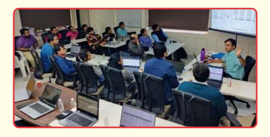
Glimpses of Seminar - Discussion on Common ITR forms.